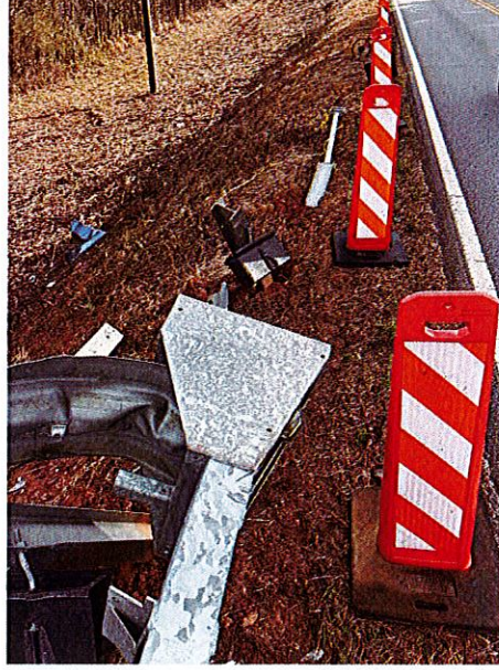
Pictures of Damage ( Vendors are advised to visit project site before submitting quote ).