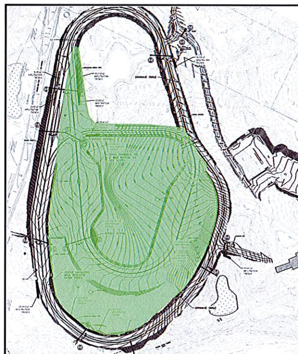
Phase II – Internal & Loop Tracks